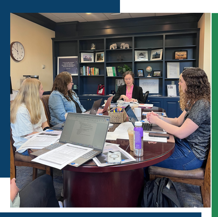
Specialty Docket Workshops